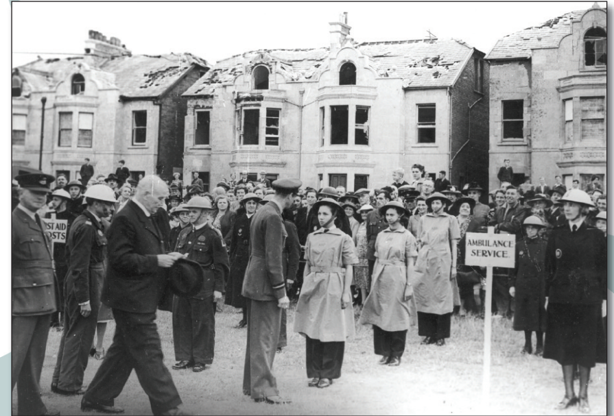
The Duke of Kent talks to volunteers after the blitz, 10 July 1942.