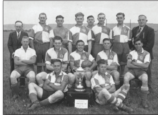
The Langford Rovers football team, 1938/39.