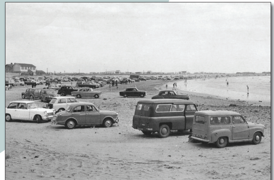
A summer weekend at the Uphill end of Weston beach, 1963.