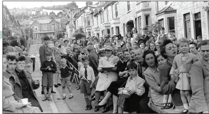
Below: Waterloo Street, 1 November 1958.