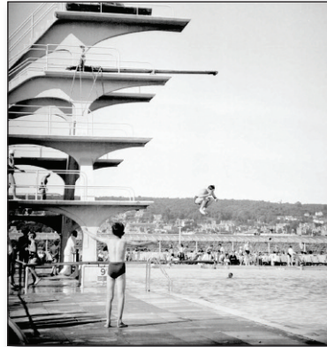
Open Air Pool, 1960s.